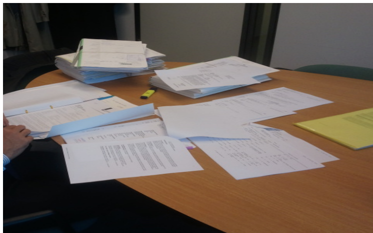
Figure 2: Juxtaposing conflicting accounts, a yellow marker ready

Judges, too, engage in such informational jiggling activities - although they, unlike clerks, may prefer to use yellow markers in their highlighting practices (see Figure 2).